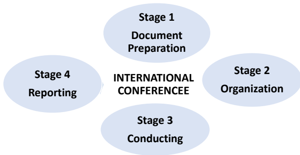
Fig. 2. The stages of The International Conference

certain stage of the conference and ensures its effectiveness. These stages are shown in Figure 2 .